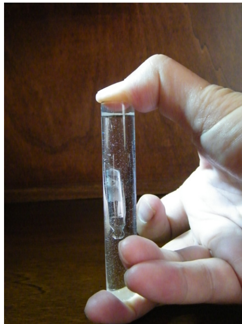
Figure 2. The diver sinks below the water surface when the pressure is increased by simply closing the test tube with a finger.

concerned with irreversible sinking and, for the moment make no mention of this phenomenon. Pedagogically significant observations at this stage often come from attentive students. Students may ask ‘ What would happen to the diver if we assumed no adhesion between the water and the inner walls of the eyedropper? ’ At this point we note that no paper referenced outlines the role of adhesion of water to the walls of the diver. In our opinion, the diver acquires greater weight because the water inside adheres to its inner walls. In this way the weight of the diver is given by the weights of the water inside and the weight of its glass portion, the weight of the air trapped inside being negligible.