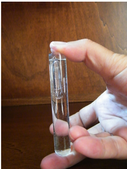
Figure 1. The diver ‘just floats’ on the water surface. The pressure is equal to the atmospheric pressure (the finger is not closing the test tube).