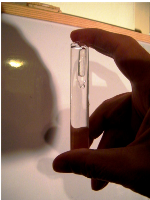
Figure 3. The diver ‘just sinks’ (i.e. it is floating just at the water surface in the test tube).